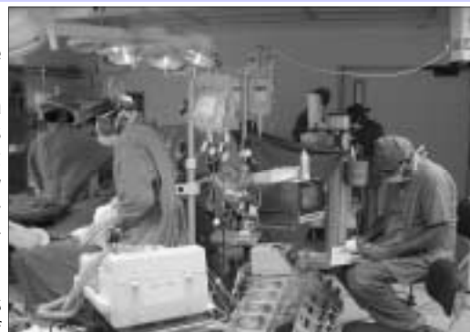
First Open Heart Surgery in progress at the Khimji Building

The Khimji building which has been built with a donation of US $3 M by the Khimji family of Canada consists of a ground floor with 16 high tech coronary care rooms which will double the present number of patients admitted in this area. The first floor with 3 state-of-the-art operating rooms and recovery areas will accommodate approximately 1000 open heart cases per year. The second floor locker and personnel lounges will provide facilities to the existing and extra staff needed to run the operating rooms. The building also houses on-call doctors' rooms. There are also 2 dedicated tutorial rooms which will enhance the educational activities. This high tech building with facilities for audiovisual aids, networking and telemedicine will prove its worth in the years to come. Besides functionality the building carries an aesthetic appeal which is a hallmark of all buildings of AKU campuses. ■