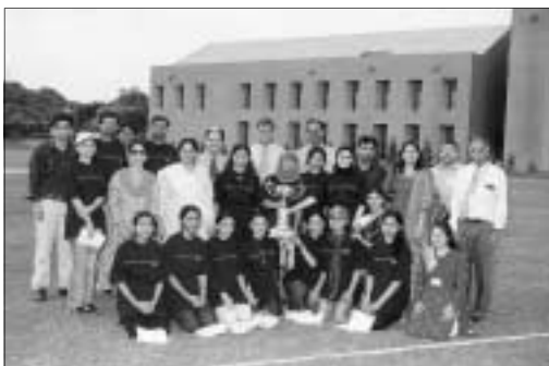
Clinical Laboratory Women Cricket Team

The Finals of the Inter- Department Tape Ball Cricket Tournament 2003 organized by the Faculty & Staff Sports & Recreation Committee in collaboration with the Sports & Rehabilitation Centre was played between Clinical Laboratory Women's Team Vs. Nutrition & Food Services Women Team and NICU/Anaesthesia Men Team Vs. Sports Centre Men Team.