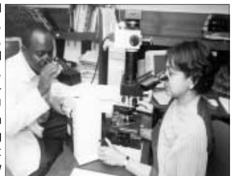
Guests from AKU Nairobi

26 to August 26, 2003. The training imparted to them was of high quality and proved to be extremely fruitful for them. They hope to go back and set up their own immunohistochemistry section under the continued support and guidance of Histopathology Section of Clinical Laboratory of AKUH. ■