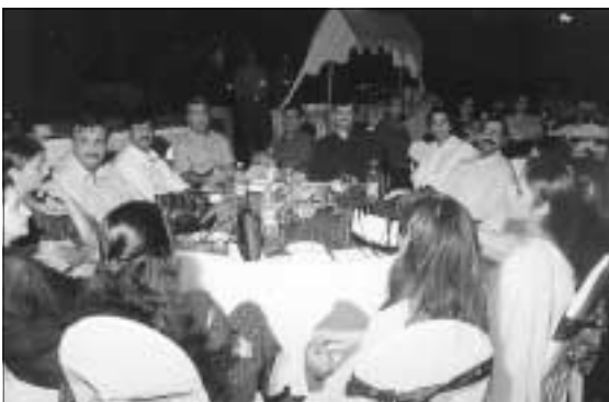
Some guests at the dinner.