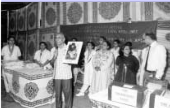
Celebration of International Breast Feeding Day at AKU.

Aga Khan University Hospital celebrated International Breast Feeding Day on August 7, 2003. The event was organized by the Department of Pediatric, Out-Patient Services and Nursing Services. The theme of the event was "Breast Feeding In a Globalize World for Peace and Justice"