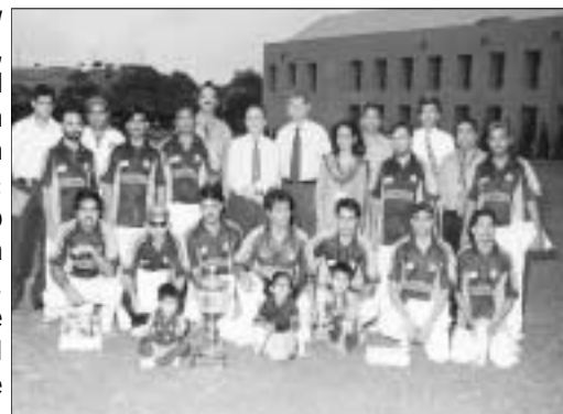
NICU/Anaesthesia Men Cricket Team