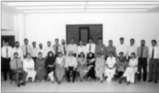
Participants of the 14th CQI Facilitation and Tools Training

The Human Resource Division's Training & Organizational Development Department organized the 14th CQI Facilitation and Tools Training Programme from September 17 to September 19, 2003. Ever since its initiation in 1994, this programme has been running successfully twice a year, training facilitators who continue to provide leadership and direction to Quality Circles, Quality Improvement Teams, and quality enhancements in their respective areas. The total of 31 participants were certified in the ceremony, bringing the total number of trained facilitators to 396. ■